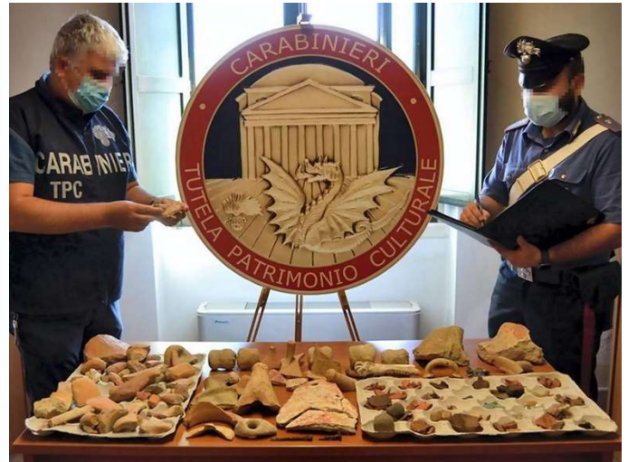
Above left: An earthenware vessel seized by police. Above right: Other highlights promoted by Europol as being seized during the latest episode of Operation Pandora.

• As an adjunct to the Interpol app article above, expertise is essential in correctly identifying items seized. One of the highlights selected by Europol from seizures during this latest exercise and pictured here is an pottery vessel. However, having been assessed by a specialist dealer, it is thought almost certainly to be fake.